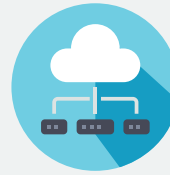
ISP Carrier Issue